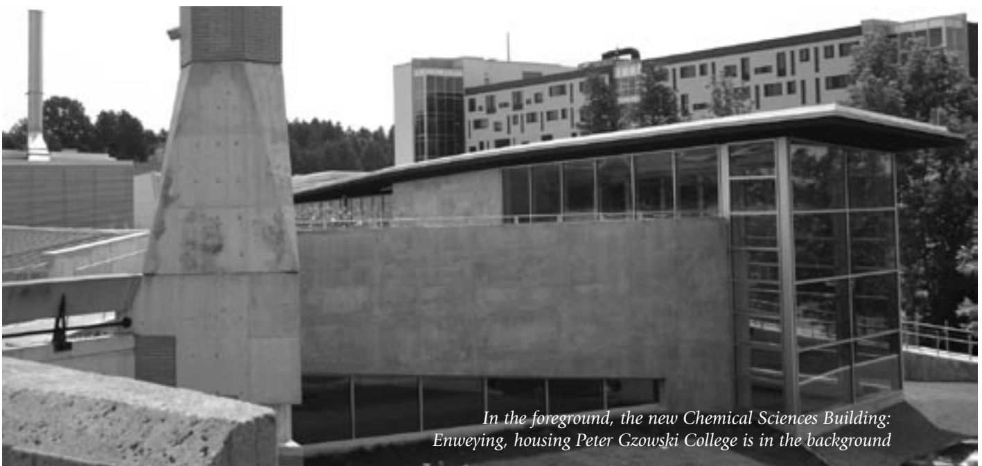
In the foreground, the new Chemical Sciences Building; Enweying, housing Peter Gzowski College is in the background

Hosted in the Enweying Building, Peter Gzowski College provides an additional 140,000-sq. ft. of academic and residential space to the Symons Campus. True to